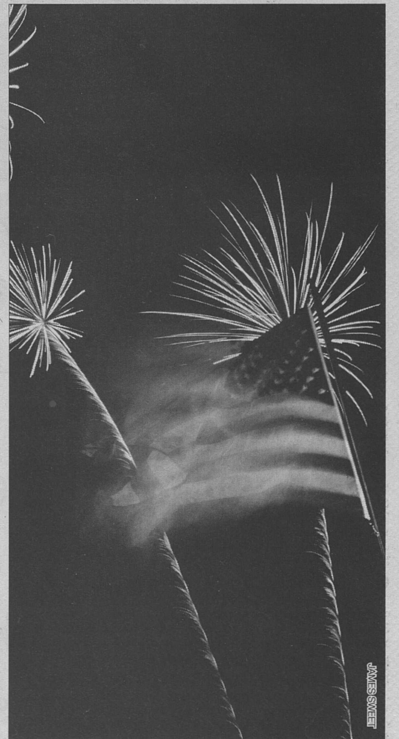
The Annual 4th of July Fireworks Show is Friday night, July 3, at the usual place on Calhoun Rd. The show will kick off around dark.