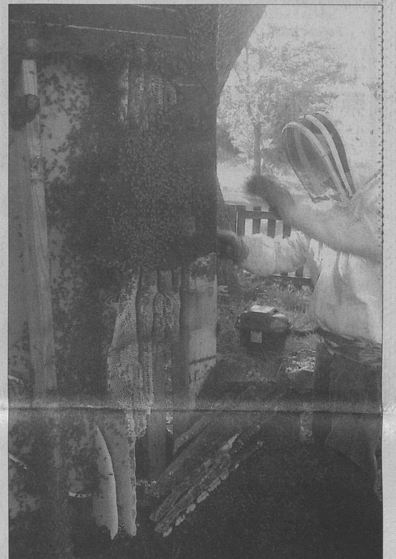
A very large colony of what are believed to be Africanized honey bees was found recently on a ranch in the Sheridan area. Beekeepers called in to remove the bees said that there were hundreds of thousands of bees in the colony.